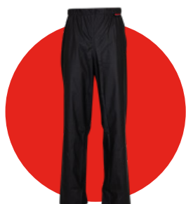
WARWICK 5300 Art. no. 2.45.300.00