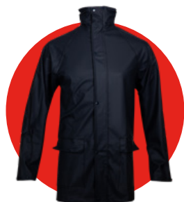
WALAKA 5200 Art. no. 2.45.200.00